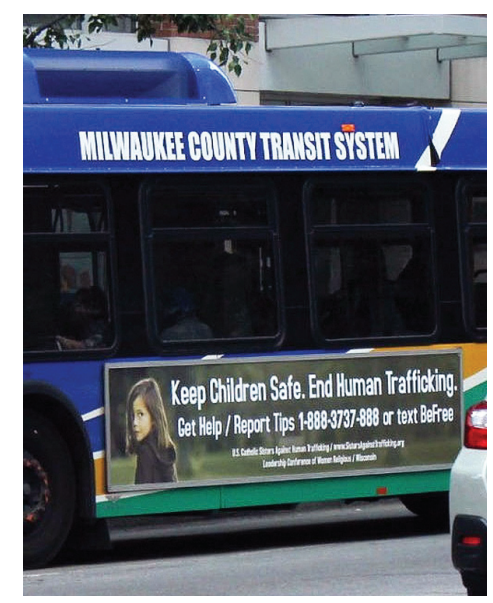
Continued on Page 5

The ad highlights the national trafficking hotline number and text address, with the hope that victims will see it and that the general public will become alert to the